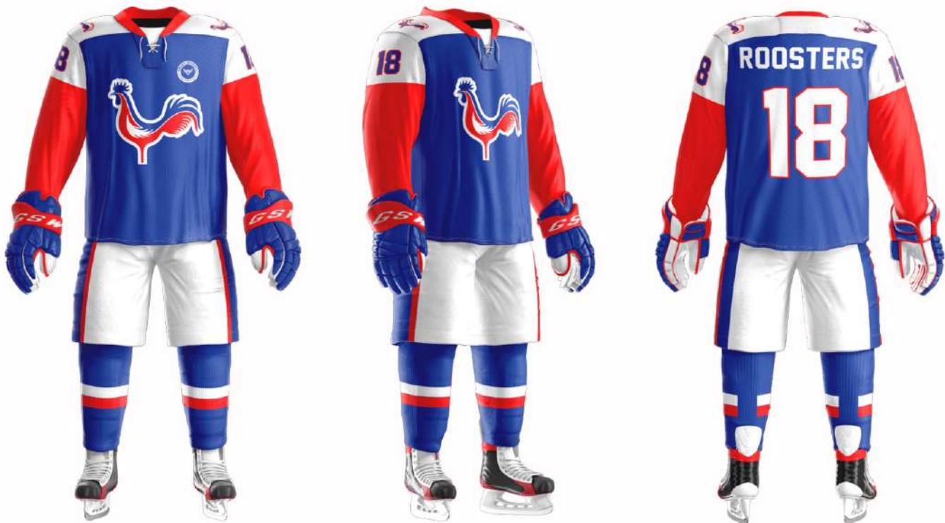
Color: Black | Blue | Grey | Green | Red | Custom Color ART# II-TU-802

Size: S | M | L | XL | XXL | 3XL | Custom Size