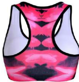
ART# II-FW-4 03