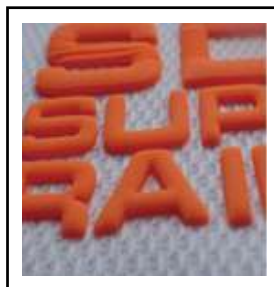
Silicon 3D Printing